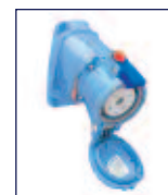
Female Receptacle with Angle Adapter 33-64043 + MP6